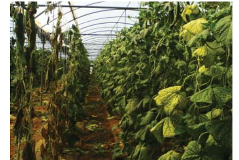
Before Sesamin EC