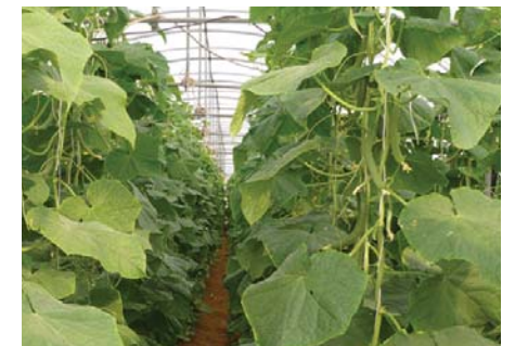
After Sesamin EC