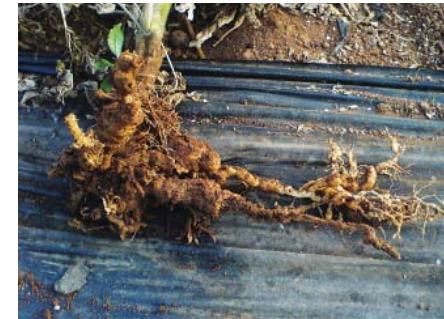
Before Sesamin EC

During a commercial application, photos were taken to show the effect of SESAMIN EC on the health of a crop infested by nematodes. The photo pairing on the right shows how the root systems have been ravaged by parasitic nematodes before application, whereas within 10 days post application, the plants have clearly grown new roots and shoots. The photo pairing on the far right depicts the visible change in overall plant health as a result of controlling the nematode population.