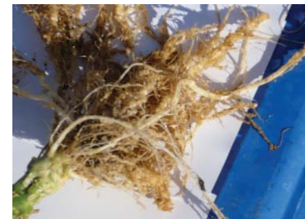
After Sesamin EC