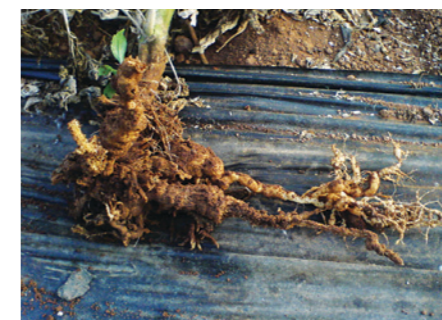
Before Sesamin EC

During a commercial application, photos were taken to show the effect of SESAMIN EC on the health of a crop infested by nematodes. The photo pairing on the right shows how the root systems have been ravaged by parasitic nematodes before application, whereas within 10 days post application, the plants have clearly grown new roots and shoots. The photo pairing on the far right depicts the visible change in overall plant health as a result of controlling the nematode population.