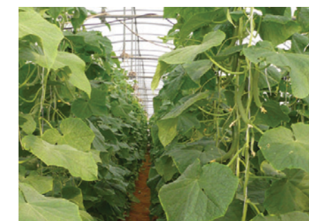
After Sesamin EC