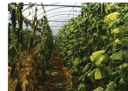
Before Sesamin EC