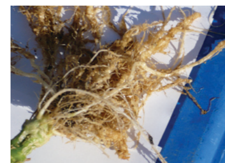
After Sesamin EC