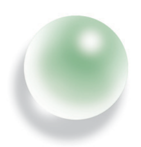
Conventional spray oil droplet

In aerial field trials, TRITEK and 435 Spray Oil were applied at the rate of 2.5 gallons per acre. Thornton Laboratories detected .003 mg/cm² of 435 Spray Oil to have been deposited on the leaves, while .0067 mg/cm² of TRITEK were found on both the top and bottom of the leaves (more than twice as much coverage).