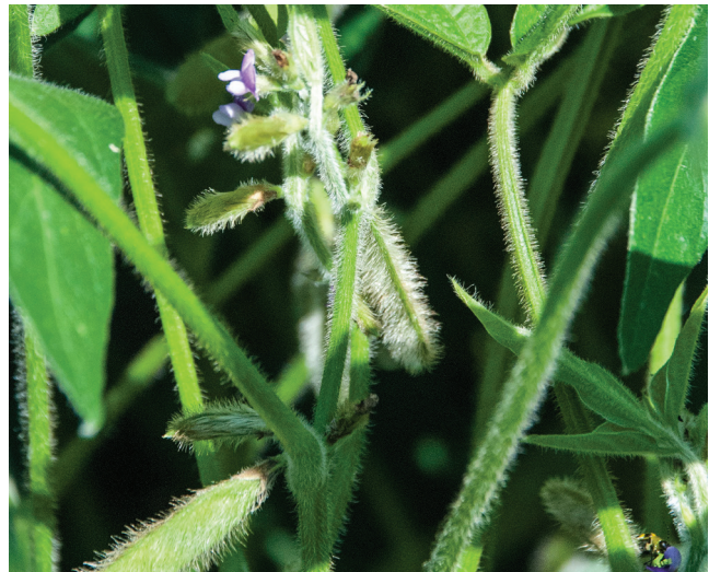
Boron improves flowering and fruiting; Molybdenum is essential to nitrogen metabolism and nodulation health.

Derived from urea, boron ethanolamine and sodium molybdate.