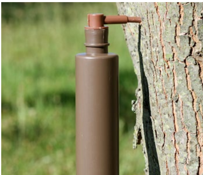
BRANDT enTREE injection device for nutrient applications.

Application is quick and easy, taking just a few minutes using a drill. No other special equipment, measuring,